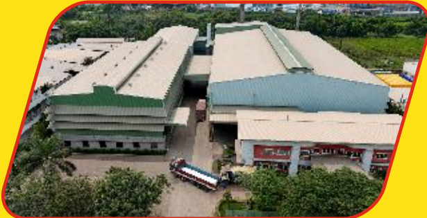
Eswari Global Metal Industries - Unit 3 Industrial Area, Baikampady, Mangalore, India