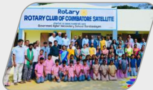
Construction of building block

Through these initiatives, we aim to contribute towards a more inclusive, empowered, and sustainable society.