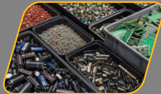
E-waste recovered products