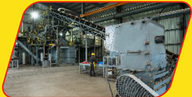
Eswari Global Metal Industries - Unit 4 Industrial Area, Baikampady, Mangalore, India