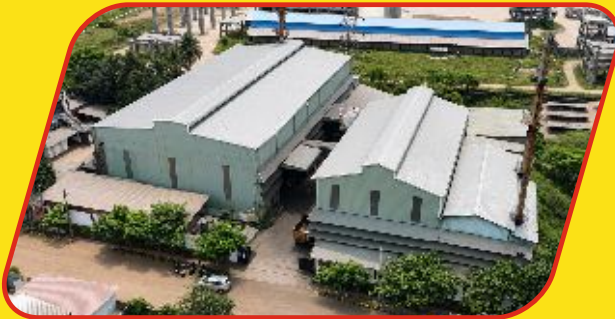
Eswari Global Metal Industries - Unit 1 Industrial Area, Baikampady, Mangalore, India