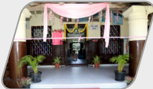
Primary School Renovation