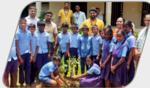
Tree Plantation at Govt. Primary School