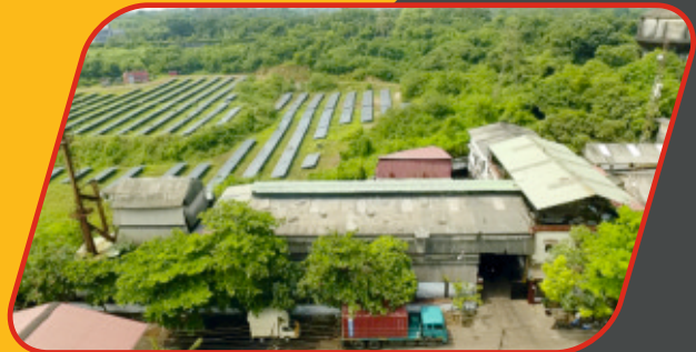
Eswari Global Metal Industries - Unit 2 Industrial Area, Baikampady, Mangalore, India