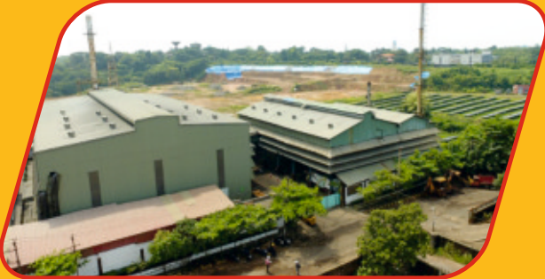
Eswari Global Metal Industries - Unit 1 Industrial Area, Baikampady, Mangalore, India