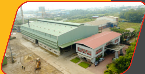
Eswari Global Metal Industries - Unit 3 Industrial Area, Baikampady, Mangalore, India