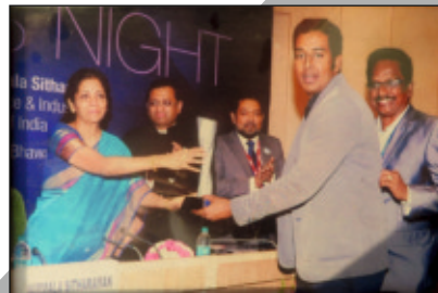
SILVER TROPHY TOP EXPORTER 2013-14