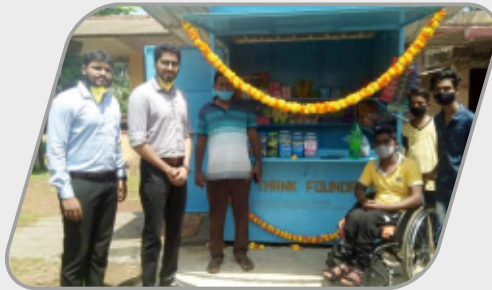
Donating Petty Shop