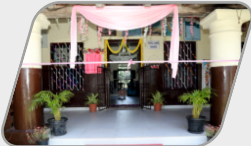
Primary School Renovation