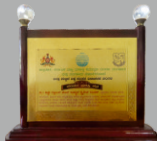
World Environment Day State Award (FY 2014, 2016, 2019)