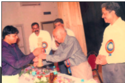
CENTRAL EXCISE DAY 2009 APPRECIATION AWARD (Highest Tax Paid)