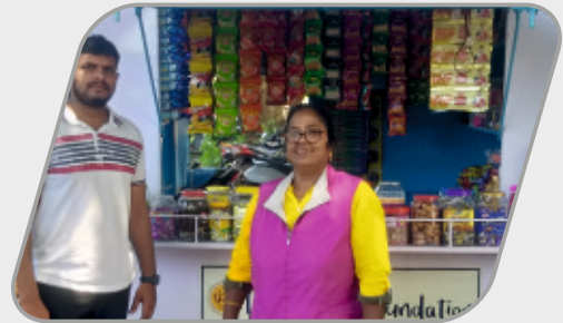
Donating Petty Shop