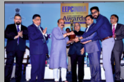
GOLD TROPHY TOP EXPORTER 2021-22